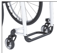
Height adjustable D style footplate