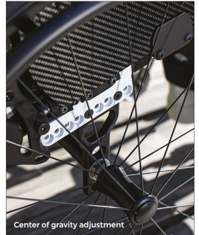
Center of gravity adjustment