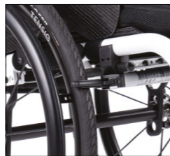
Low profile scissor lock