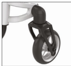
4" alu-core castor wheel with angle adjustable front fork