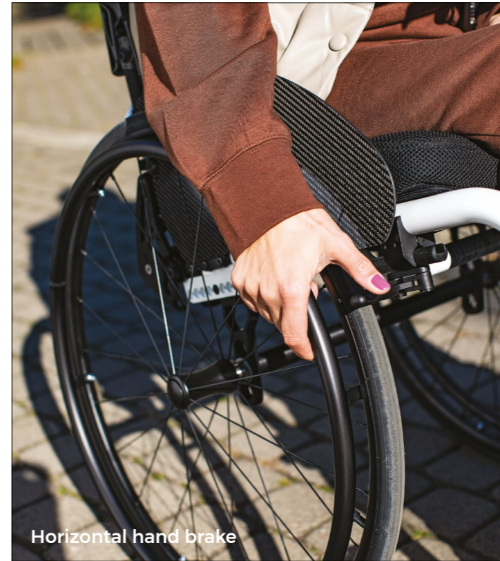
Horizontal hand brake