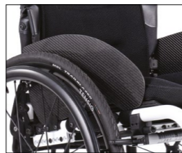
Lightweight carbon fibre side panel: foldable, removable and swing away