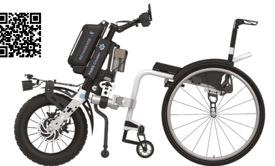
ICON 60 with PAWS