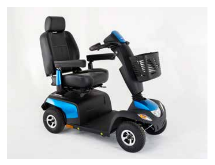
Four wheel Orion METRO