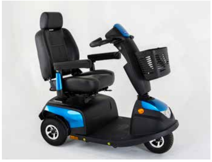
Three wheel Orion METRO