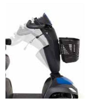
Finite tiller movement

Easily adjustable tiller with stepless adjustments designed steering to enhance steering control. This coupled with the new head tube angle of 70 degrees, help to give more responsive steering control.