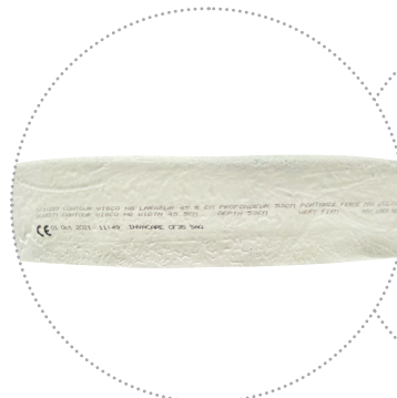
Fig. 3. Barcode

On foam cushions, this should be printed on the back edge of the cushion foams and most cover labels (see Fig. 3 & 4). Take care not to confuse this with the fire standard compliance date (see Fig. 4).