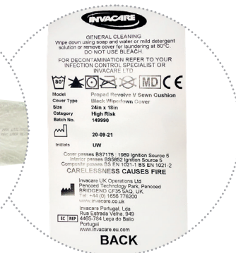
Fig. 4. Cushion label

N.B. It should be noted that Invacare cushions carry the following warranties: