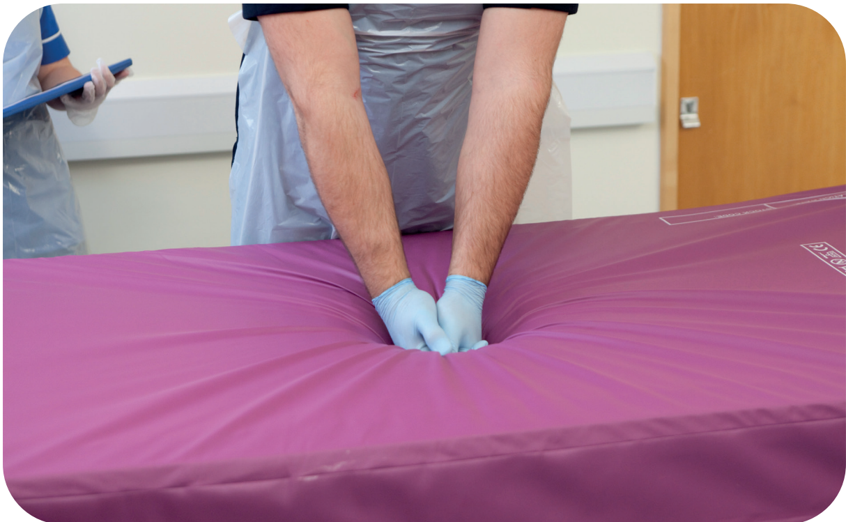
Fig. 5. Fist test

You should feel some resistance from the foam and when you release, the foam should spring quickly back into shape. A slow return to shape is normal for visco-elastic type foam (memory foam), however, they should return to shape within a couple of minutes of release. This test is only suitable for testing foam and is not intended to test gel.