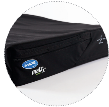
Fig. 1. Ingress Resistant Material

These features will significantly reduce the risk of fluid ingress and provide protection for the foam core.