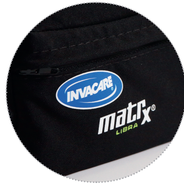
Fig. 2. Cushion Name Label

N.B. The use of a combination of cover and foam that are not from the same manufacturer, may affect the cushions pressure care properties.