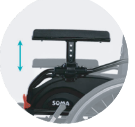
Flip-back, Height Adjustable Armrests